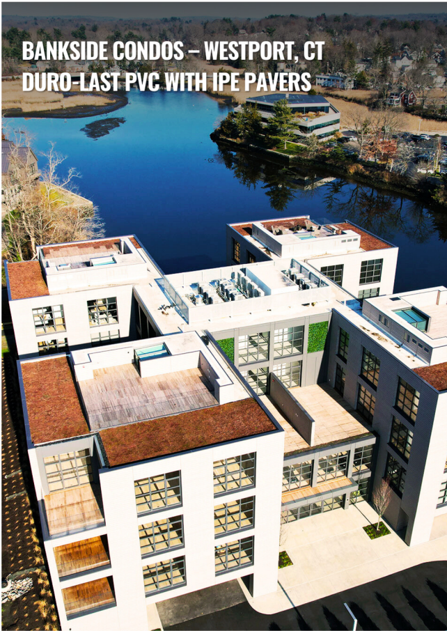
BANKSIDE CONDOS – WESTPORT, CT DURO-LAST PVC WITH IPE PAVERS