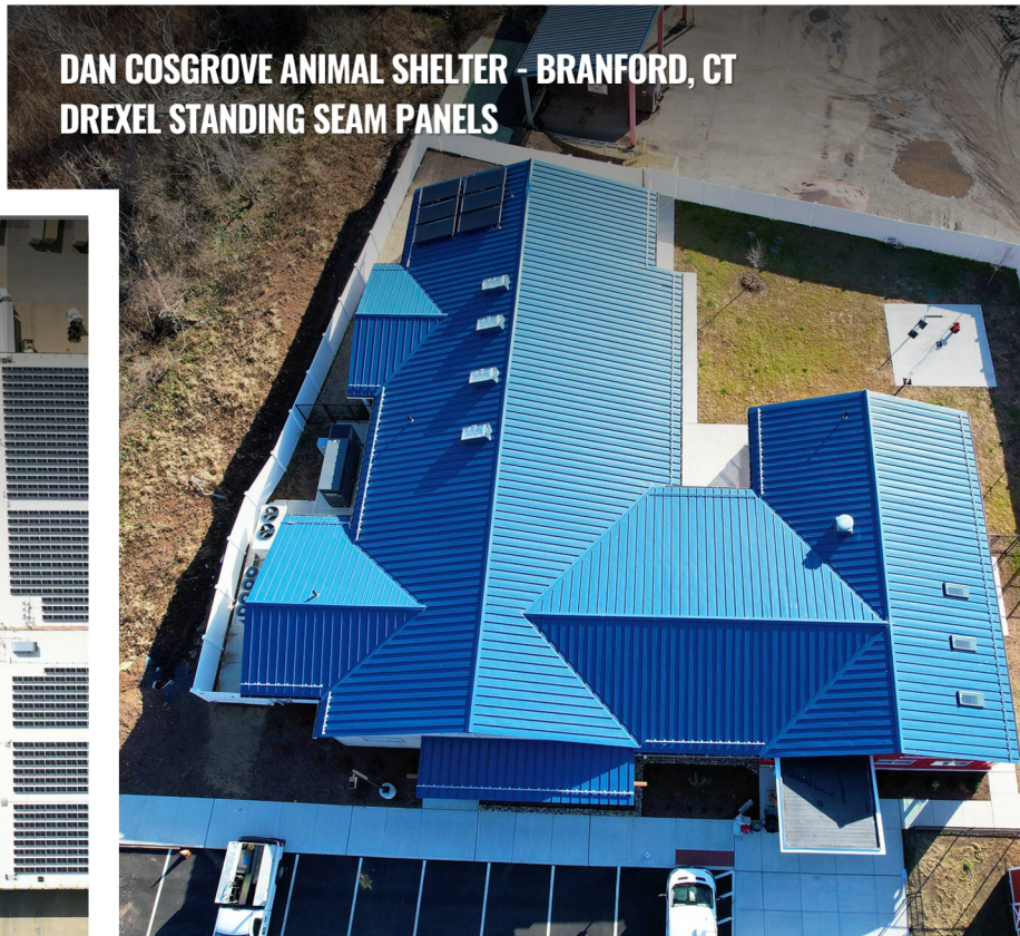
DAN COSGROVE ANIMAL SHELTER - BRANFORD, CT DREXEL STANDING SEAM PANELS