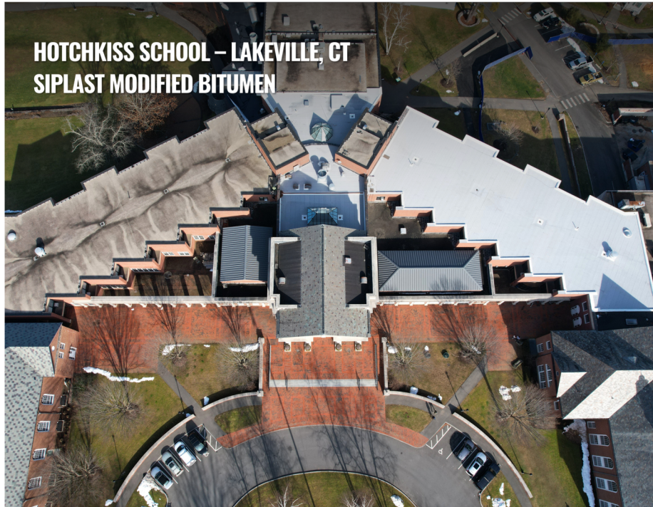
HOTCHKISS SCHOOL – LAKEVILLE, CT SIPLAST MODIFIED BITUMEN